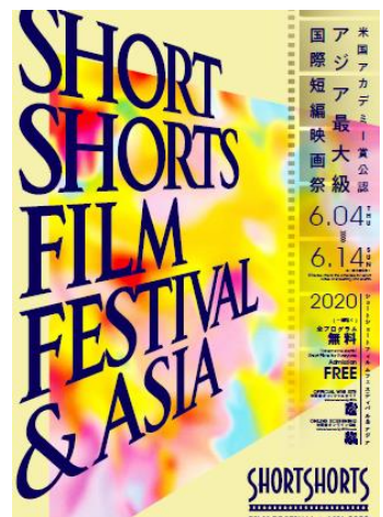
<Official Visual of Festival>

* Program details are subject to change.