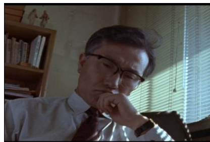
Short film 『Incoherence』

An editorial writer who habitually steals milk as he goes for his morning jog, an elite prosecutor who is caught by an security guard as he was about to urinate on the street, drunk, and a university professor who enjoys pornographic magazines, get together on a television program to discuss social issues.