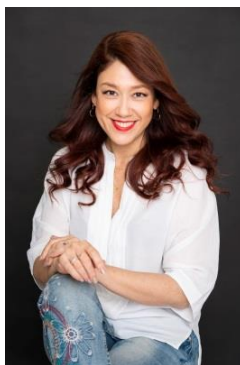
LiLiCo (Film Commentator)

That passion can transcend borders and will connect Japan to the future of the world.