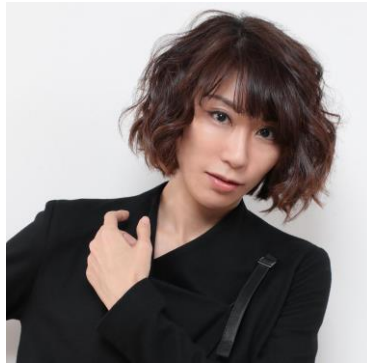
Juri Manase (Actress)